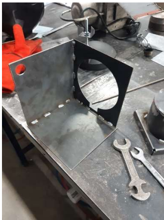
New headlights under construction