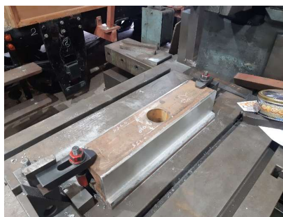
Crosshead slippers metallised and being machined

The S-class consisted of five locomotives named after Irish mountains covering a wide geography. No.170 Errigal (County Donegal), No.171 Slieve Gullion (County Armagh), No.172 Slieve Donard (County Down), No.173 Galtee More (County Limerick/Tipperary) and No.174 Carrantuohill (County Kerry).