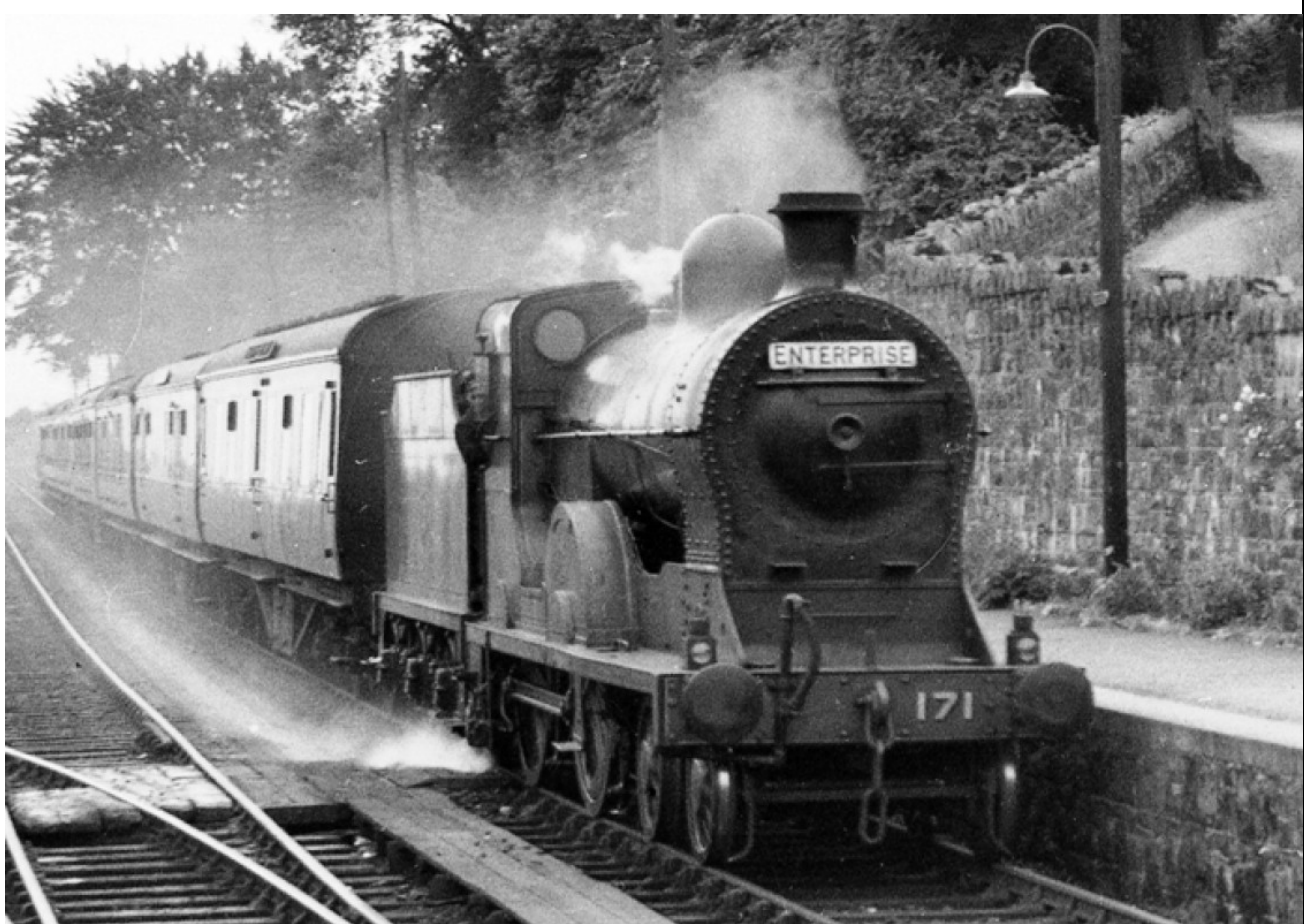
28/6/1952: No.171 before preservation and in her natural habitat, passing through Goraghwood with the Down (Dublin-Belfast) Enterprise.