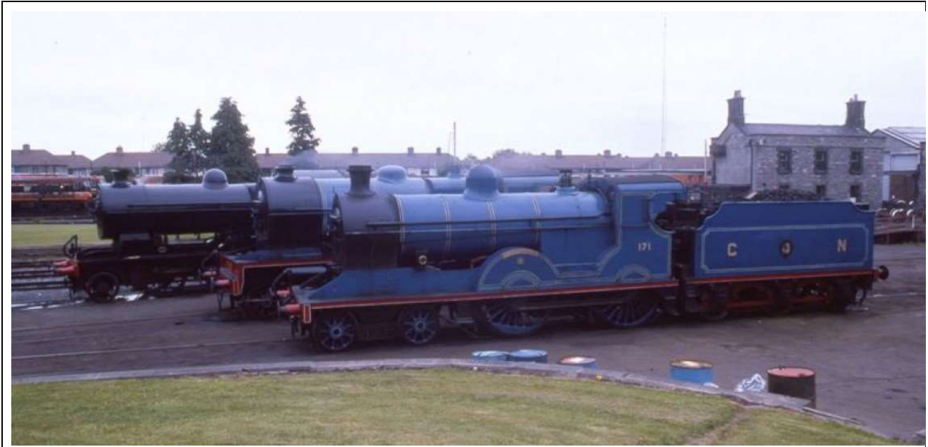
171 at Inchicore in 1995 with No.85 and No.461. (CP Friel)

At 573 metres, Slieve Gullion towers over the South Armagh countryside, its volcanic origins clearly apparent to the onlooker. It is a 'challenging' climb!