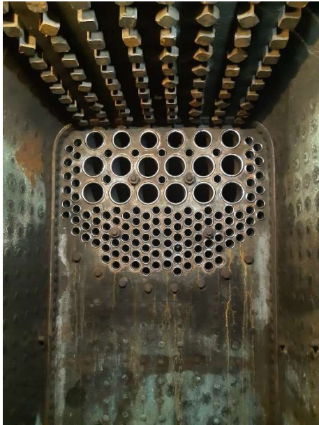
The boiler is retubed and tubes beaded.

Outstanding work to return the locomotive to the main line in 2023 falls into three main milestones, most of which we can do in-house: